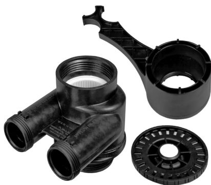
In-Out Tank Head with Fill Port (P/N LC-D1220-01)