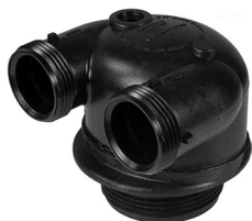
In-Out Tank Head (P/N LC-D1400)